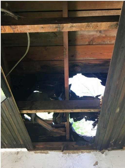
Before of porch ceiling...